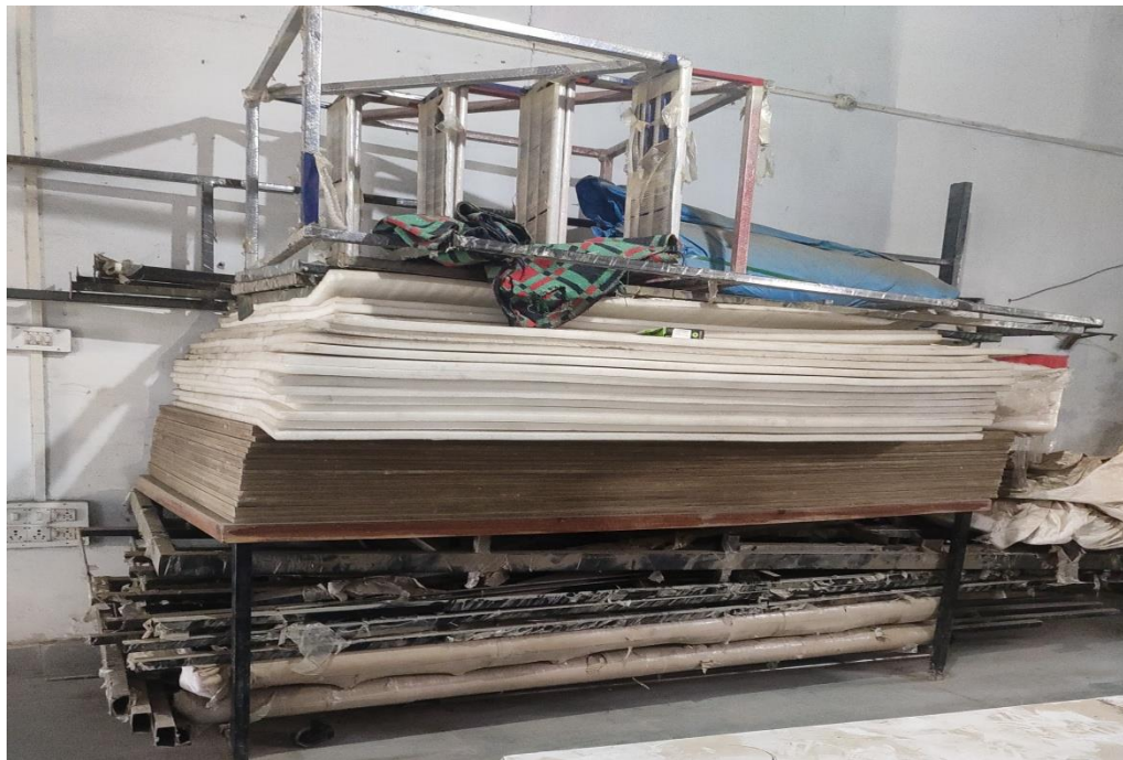
TREADMILL ,WORKSTATION, BOXING MATS IN SPORTS ROOM