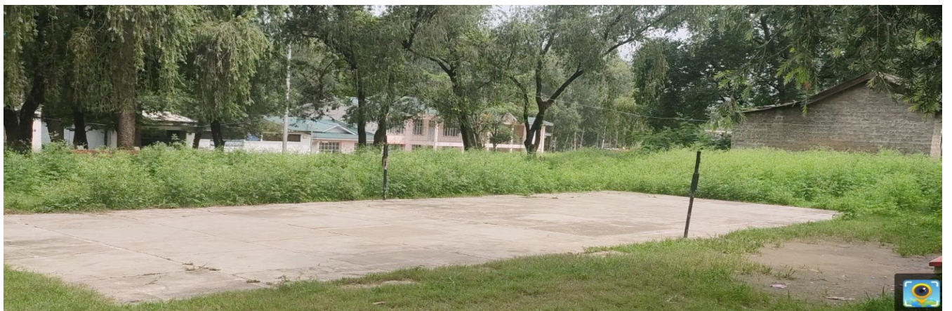
BASKET BALL COURTS ,FIELD, BADMINTON COURT FOR VARIOUS OUTDOOR GAMES