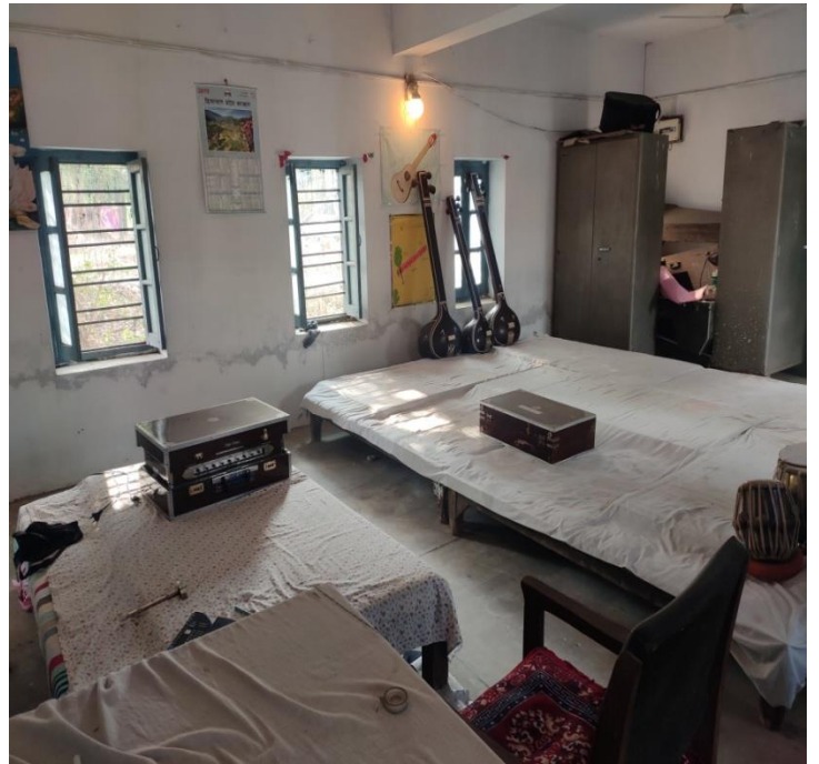
INSTRUMENTS AND AUDITORIUM FOR CULTURAL EVENTS