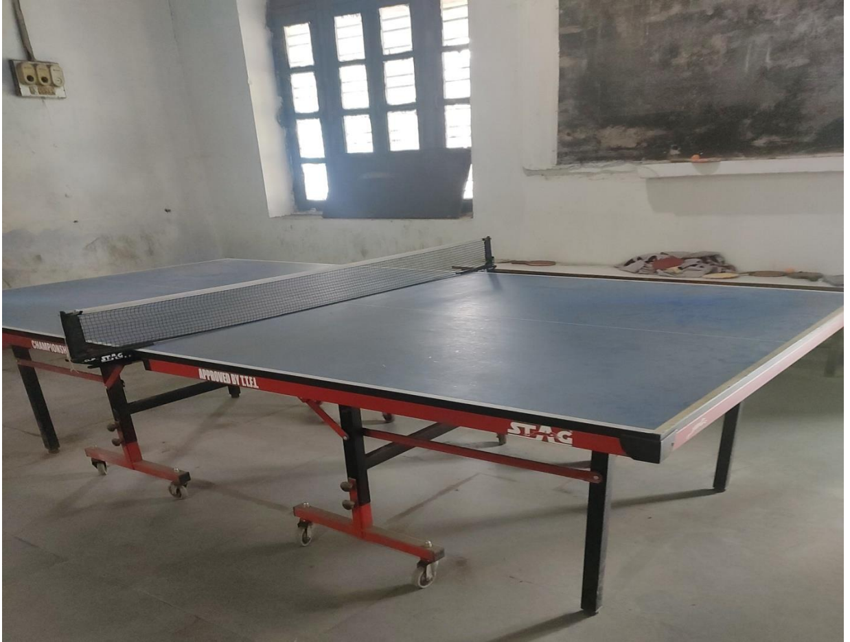
TABLE TENNIS IN SPORTS ROOM